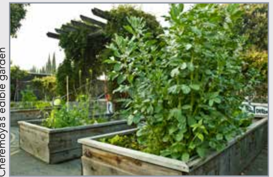
Cheremoya's edible garden