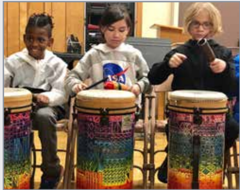
Third grade music class