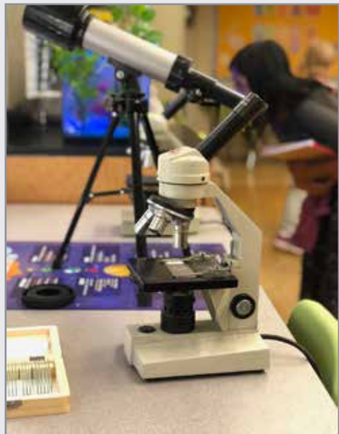
Cheremoya's science lab

The NGSS enable teachers to offer all students interactive instruction which promotes analysis and interpretation of data, critical thinking, problem solving, and connections across science disciplines. Each year, students should be able to demonstrate greater capacity for connecting knowledge across and between the physical sciences, life sciences, earth and space sciences, and engineering design. The highly engaging, phenomena-based Amplify Science curriculum built for the California NGSS will be used starting in 2020-21.