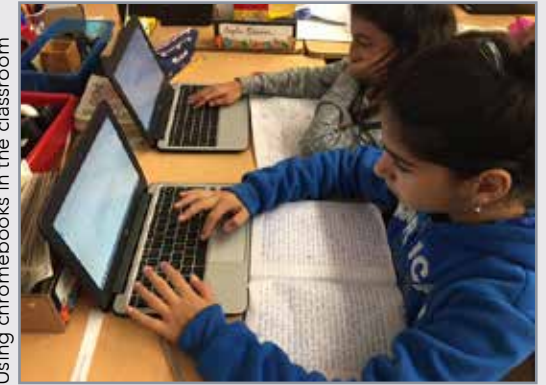
Using chromebooks in the classroom

G.A.T.E students receive differentiated educational programs throughout the year as breakout themed classes which are supported by the Cheremoya Foundation. Themes include MathMagic, Science Detectives, Mock Trial, Debating, and ChemKids.