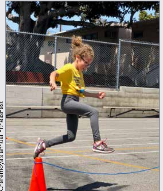
Cheremoya's annual FitnessFest